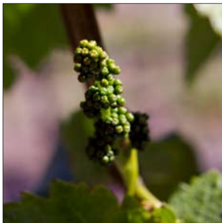
Flowering at Fe Ciega Vineyard

DONT MISS OUT! If you would like to receive the Grand Tastevin Order shipments and have not already signed up, please email info@longoriawine.com or phone 866-759-4637. The cost per shipment is approximately $100 to $250. You must be a Wine Club Member to sign up for the Grand Tastevin Order.