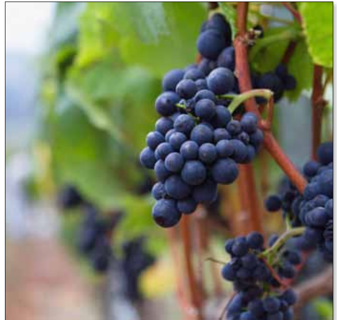
Pinot Noir ready to be picked on the day of harvest. September 16th, 2011 at Fe Ciega Vineyard

Become a Longoria Wines Facebook Fan and keep up with what we're doing throughout the year! See the latest videos and photos of what's happening in the winery and vineyard. Read articles written about us and our wines. Go to: www.facebook.com/LongoriaWines